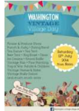
Washington Village Day 12 th July 2014

The results of the Community Survey were presented to the public at Storrington & Sullington’s Annual Parish Meeting on 28 th May 2014 (see Appendix F4 for presentation slides).