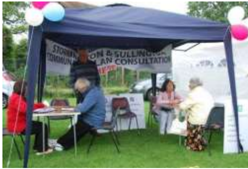
Storrington Village Day: 21 st June 2014