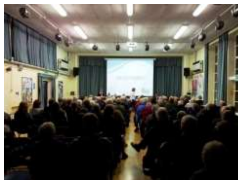
Attendees at 21 st November 2013 Public Meeting